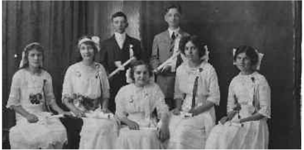
†The first graduating class of Ascension School.

The Centennial belongs to all of us: to students and their families, to faculty and staff, to parishioners and neighbors and alumni. Primary among our goals is that during the course of our year-long celebration, we will have programs or events that include each branch of our extended family. Some events are alumni-focused, some student-focused, some for adults and some for children. Read the calendar on the next page and see how you’d like to celebrate.