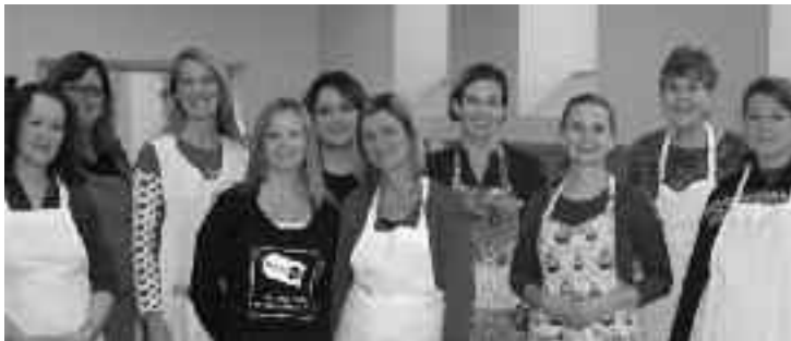
Some of the volunteers who helped with the fifth grade cookie bake in December. We bet they'll all have recipes for the Centennial cookbook!