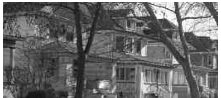
The 800 block of Gunderson has been home to many Ascension students; Are you one of them?